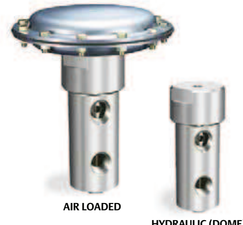
HYDRAULIC (DOME) LOADED

1. For extended temperatures up to 350°F / 177°C, consult TESCOM. Teflon®. Viton® and Kalrez® are registered trademarks of E.I du Pont de Nemours and Company.