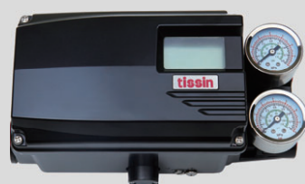
TS800 Standard type