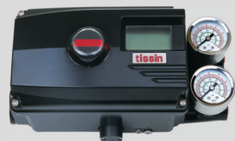
TS800 with Limit switch type