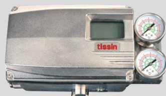
TS805 Stainless steel 316 type